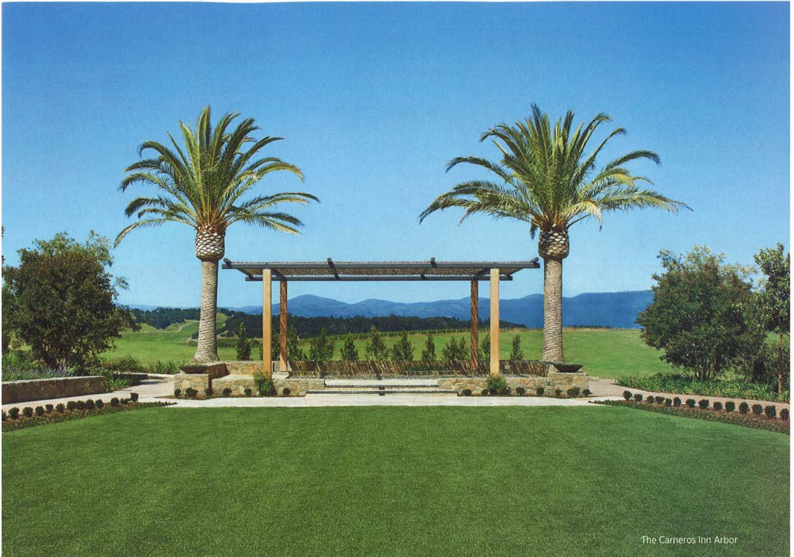
The Carneros Inn Arbor