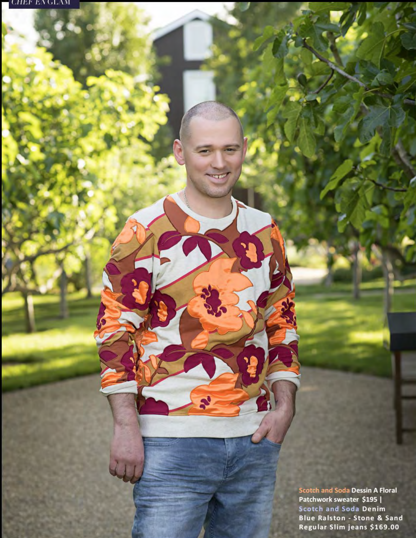
Scotch and Soda Dessin A Floral Patchwork sweater $195 | Scotch and Soda Denim Blue Ralston - Stone & Sand Regular Slim jeans $169.00